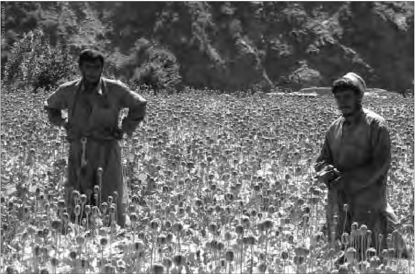
Opium poppy fields in Afghanistan.

Relief assistance will rarely be the only type of intervention needed.