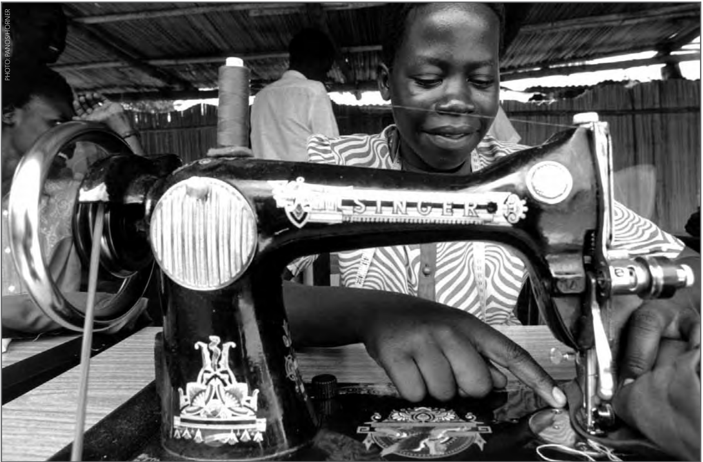
A girl works at a sewing machine, part of a skills training workshop in Uganda.

depend on women since many were not able to resume income-generating activities either because they suffered from disabilities or because institutions that had employed them had collapsed during the war (Gardner and El Bushra 2004). Women's central involvement in livelihood protection makes them key participants in both assisted and unassisted recovery strategies. Appropriate assistance can be targeted for women to help maximize the effectiveness of their livelihood strategies and create employment opportunities for men so that they are able to contribute to the welfare of the household.