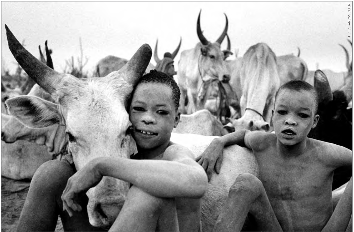
Dinka boys with their cattle.

standard of living as the host community without depleting the (often scarce) resources of the hosts. This may require a "cross-mandate" approach where similar assistance is offered to groups who might not be included in an agency's traditional focus. The community-based assistance approach was tried with considerable success in Central America during the 1980s, and during the early 1990s in Cambodia and Ethiopia.